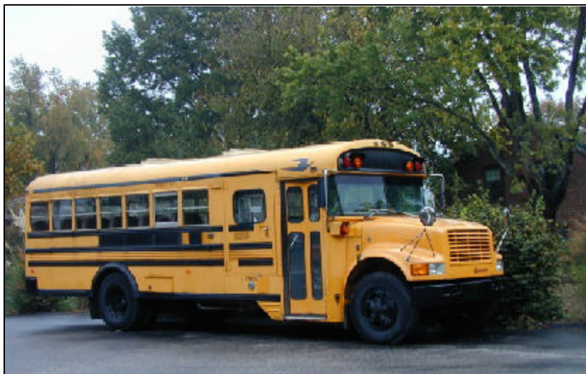
Prior to purchasing these buses, the University of Charleston only had an eight-passenger van to accommodate their transportation needs.

for Surplus Property in Dunbar. You might be pleasantly surprised at the bargains YOUR organization will find.