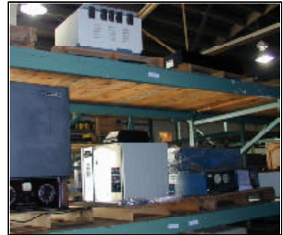
The Black Knight Trading Company's storage capacity increased by using surplus shelving.

In addition to the great bargains at Surplus Property, Mills stresses about the helpfulness of the staff, who he describes as just 'good people'. "Once we bought as