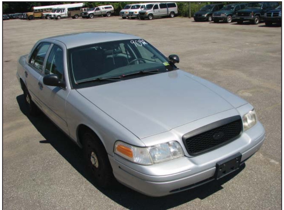
The West Virginia State Agency for Surplus Property stocks a variety of retired state vehicles which often find new homes as vehicles for use by municipalities throughout the state.

"We knew that we could not buy a vehicle new, and certainly not as