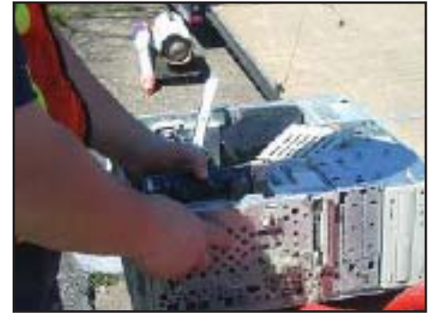
PC Renewal of Morgantown works with Surplus Property to help with the recycling and disposing of computers and related items.

that recycling is the proper disposition method, our agency will send the Surplus Property Retirement Form back to the agency, who will in turn use as a release order to PC Renewal. The company will then schedule a time to remove the items listed on the form. A certificate of destruction/recycling is issued to the agency, along with the total weight."