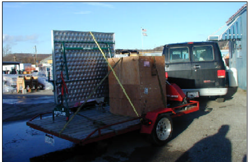
Loaded and Ready to Go

Please note that a listing of state vehicles available are posted and updated weekly on the Surplus Property's website at www.state.wv.us/admin/purchase/travel .