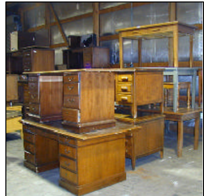
Desks are just some of the property available by sealed bid.

Aside from the 'usual' items, Frye said Surplus Property occasionally receives those