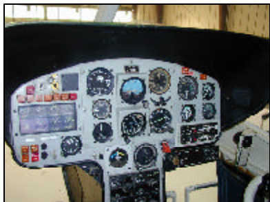
Pictured is a close up of the control panel of the aircraft.

Utilizing trade publications and other resources, the West Virginia State Agency for Surplus Property strongly publicized the availability of a 1971 Bell 206B Jetranger Helicopter, no longer needed by the Department of Environmental Protection (DEP).