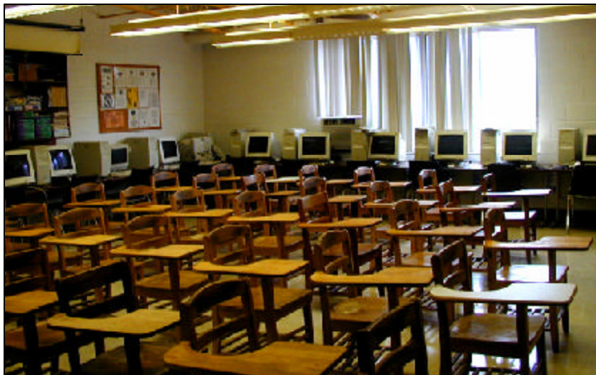
Classrooms at Clay Middle School are filled with computers which were acquired through the Surplus Property Program. Each room has up to 15 computers for the student's use.

Last spring, the school was broken into and the safe, which