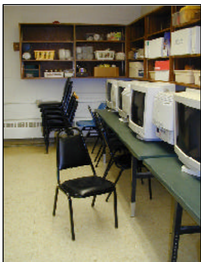
Computers are one of the greatest benefits that Clay Middle School have realized recently.

the burglars could not open, was rendered unusable. One of the teachers visited Surplus Property