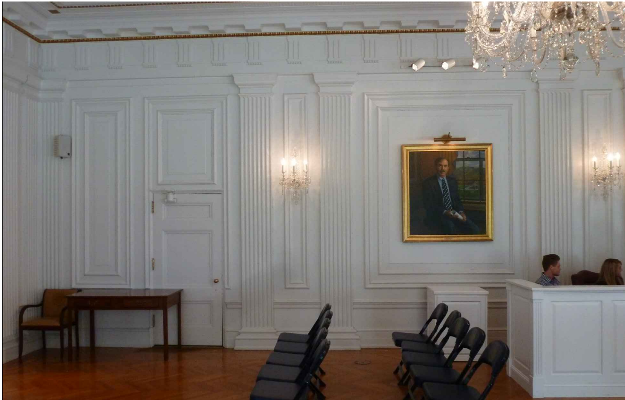
A Governor's Reception Room - North Wall (west end)