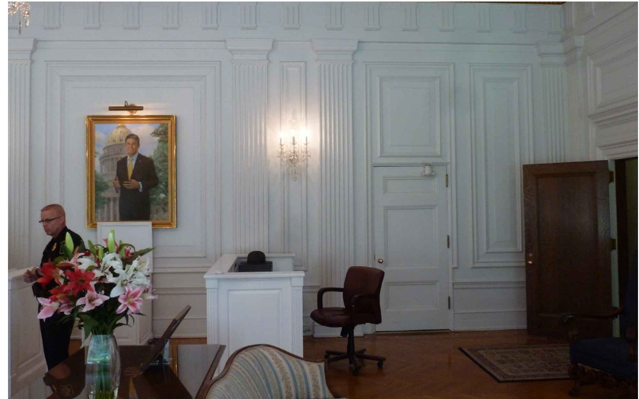
B Governor's Reception Room - North Wall (east end)