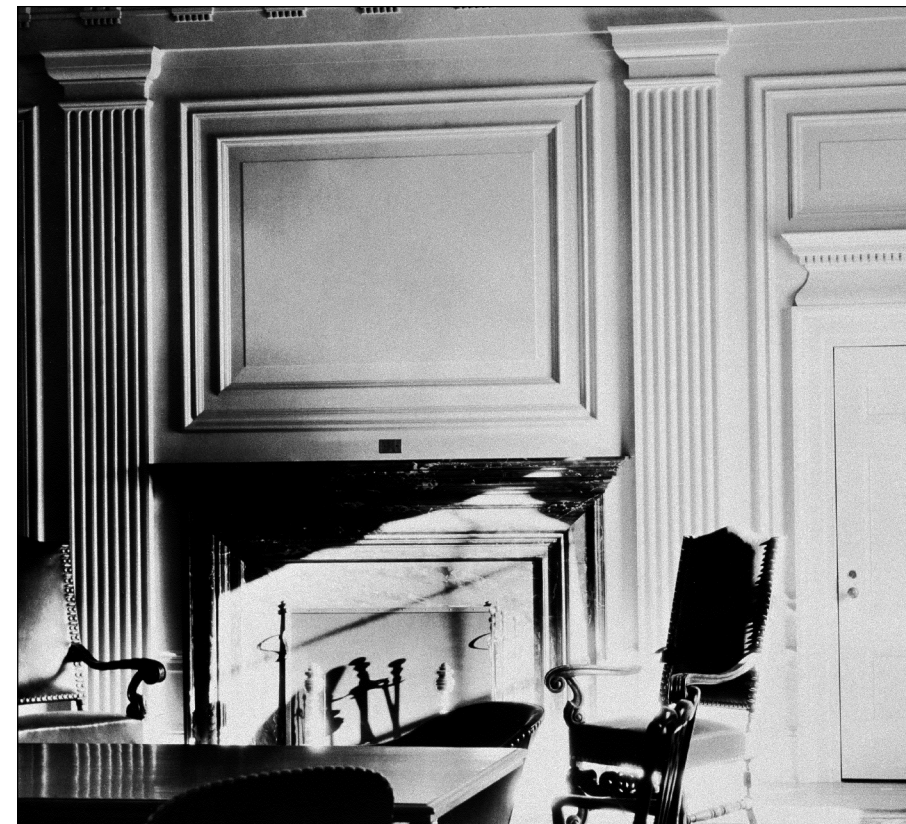
C2 Governor's Reception Room - East Wall (original)