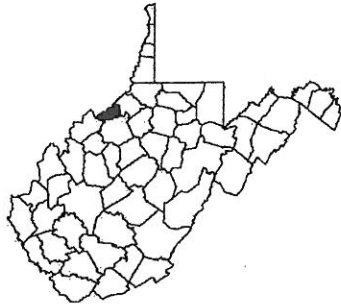
KEY MAP OF COUNTIES