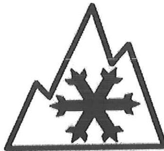
Severe winter traction icon

NOTE: Some newer tires are designed for use in severe snow conditions and are marked on at least one sidewall with the letters "M" and "S" (e.g., MS, M/S, M&S, M+S, etc.) plus have a pictograph of a mountain with a snowflake. If you need more information on tires designed for severe snow conditions contact the CTQP Administrator (at (810) 677-5745) or refer to Rubber Manufacturers Association, Tire Information Service Bulletin, Volume 37, Number 2, February 1999 and titled "RMA Definition for Passenger and Light Truck Tires for Use in Severe Snow Conditions." An example of the mountain/snowflake is shown below.