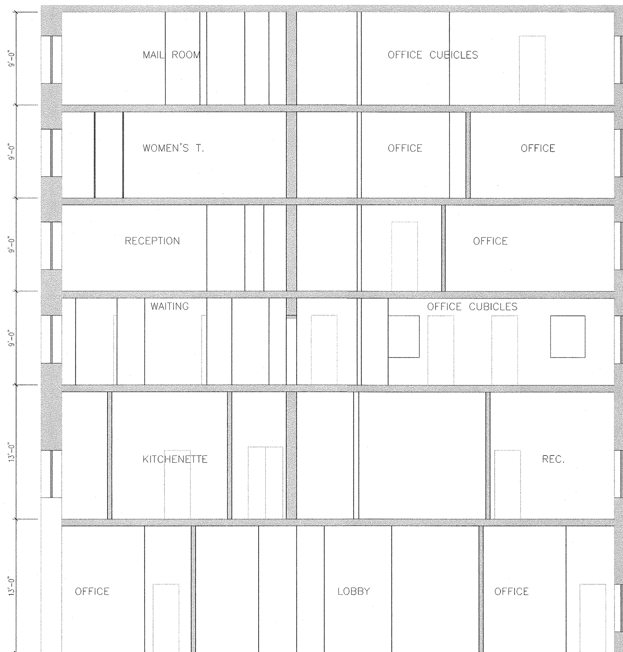
SECTION A SCALE: 3/16" = 1'-0"