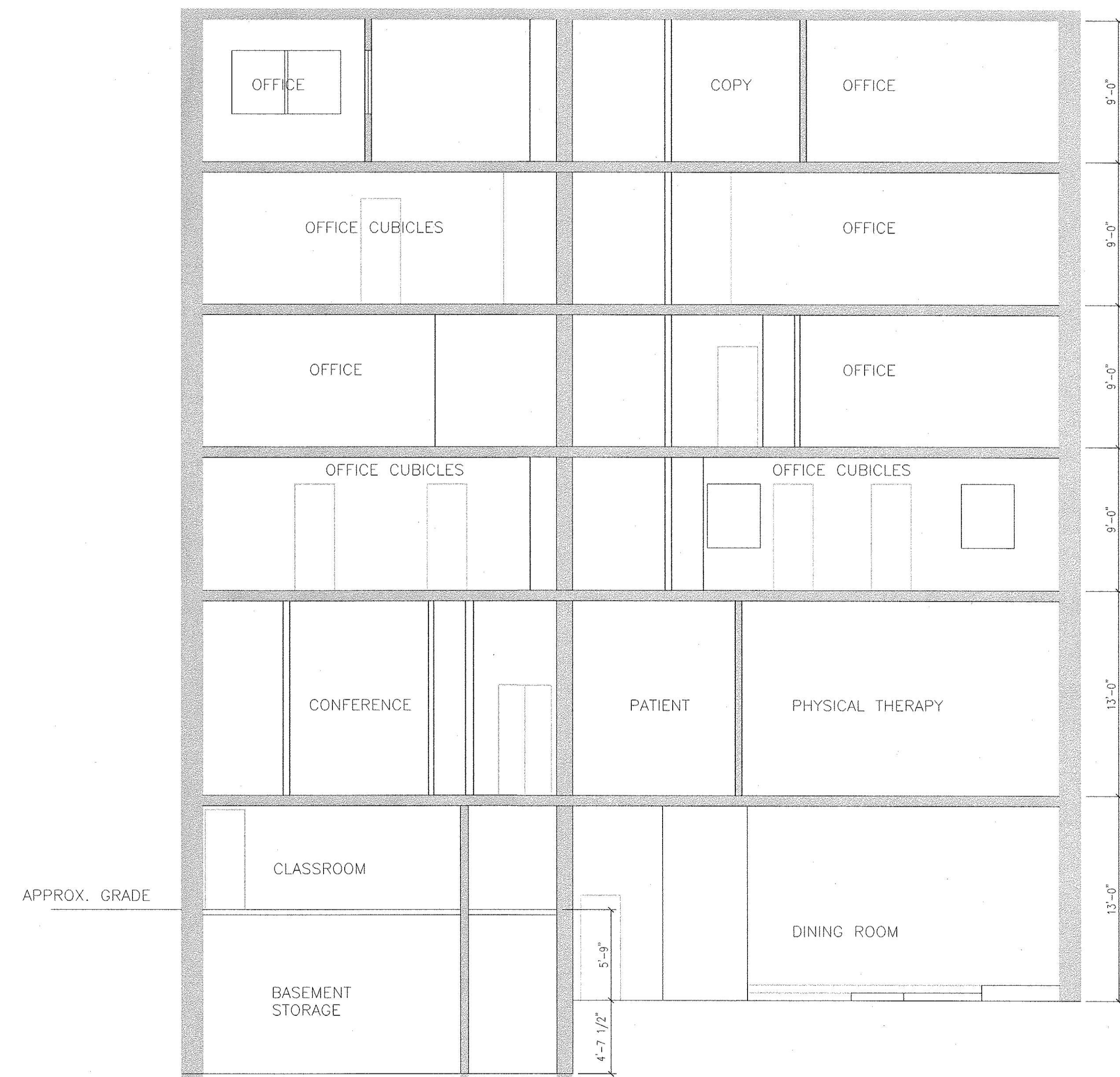
SECTION B SCALE: 3/16" = 1'-0"