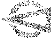
Existing MH Data - Line 1