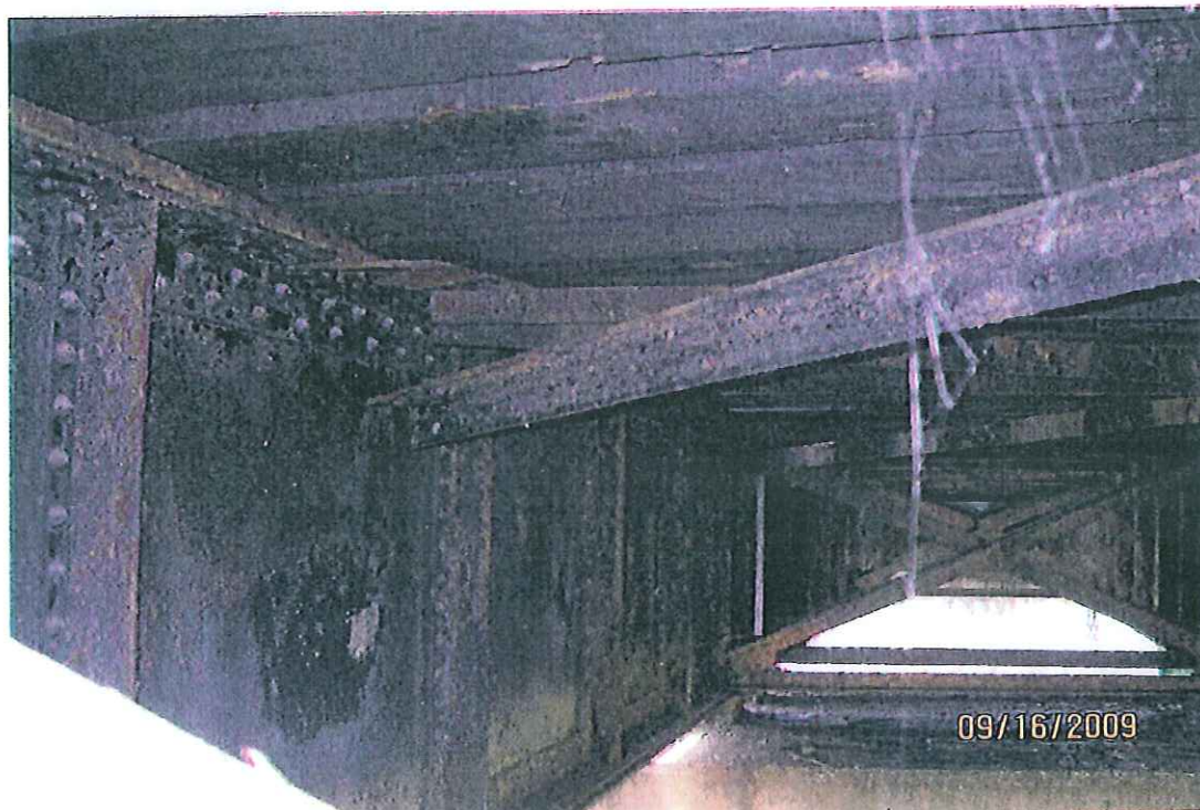
Photo 12 Two top lateral braces are not attached in Span 3.