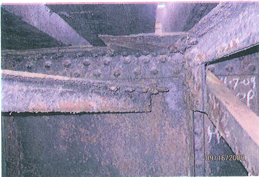
Photo 11 Top lateral brace at NE end of Girder 2 not connected in Span 3.