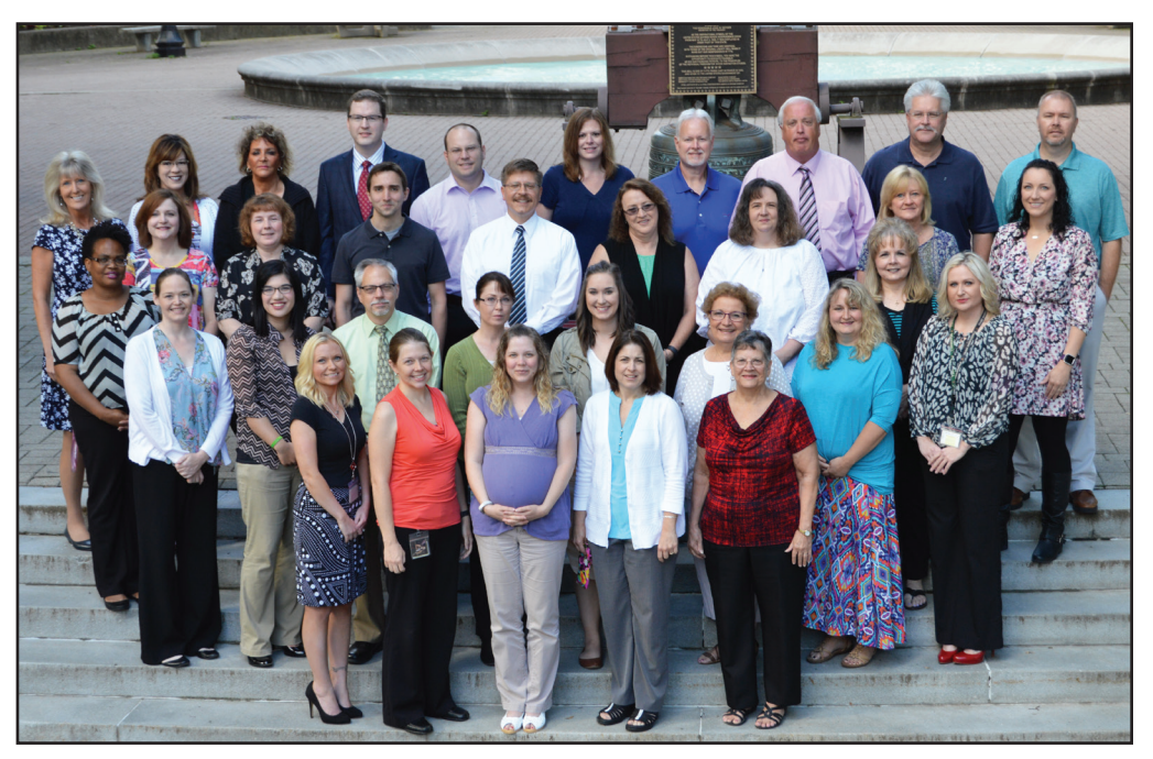
Purchasing Division staff joined together in June to take the staff photograph (above) on the Capitol steps. This has become an annual tradition for the agency, with each year's photograph proudly displayed in the hallway at the office.

The Purchasing Division is always looking for ways to improve and expedite the purchasing process. We challenge you to share your ideas of how we can make this happen. After all, when we work as a team, we can achieve great things together!