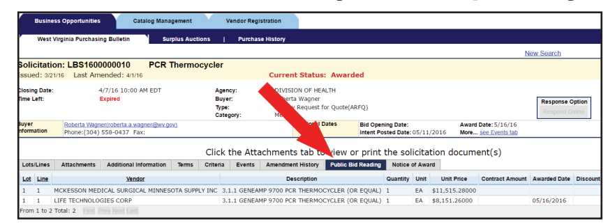
The Public Bid Reading tab becomes visible in the Purchasing Bulletin after the Publish flag is checked and the EV document becomes Final.

Why is this important? When an award is finalized for a solicitation, all vendors who responded to that solicitation electronically are notified automatically, provided an e-mail address is associated with their account. Then, as long as the Publish flag is checked and EV is in Final phase, the Public Bid Reading tab will become visible in Vendor Self Service (VSS) for vendors and the general public to view.