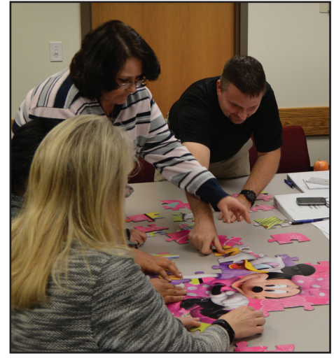
Attendees work together during a Developing Specifications workshop to assemble a puzzle and then write specifications for the missing piece.

The Purchasing Division continues to implement such activities and has been pleased with the positive response re-