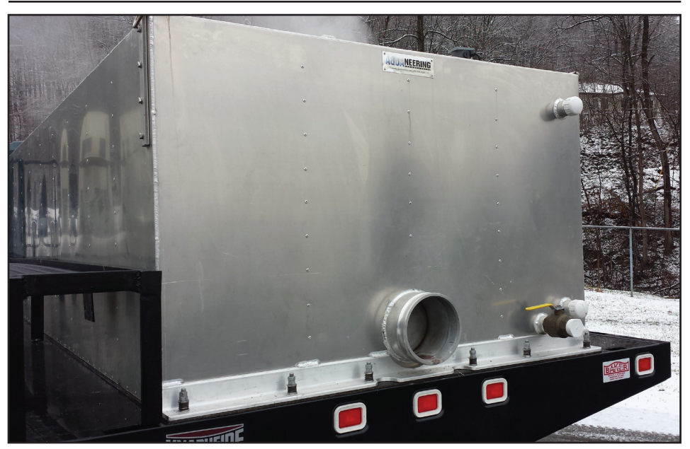
The fish distribution tanks have a water capacity of approximately 1,200 gallons and contain five separate compartments for storing fish on their way to distribution.

"The trucks may go to multiple streams and lakes during a run. For example, when they load the trucks, the compartments can be utilized deep 1200 ies for stant used from built Not stant with they load the trucks, the compartments can be utilized