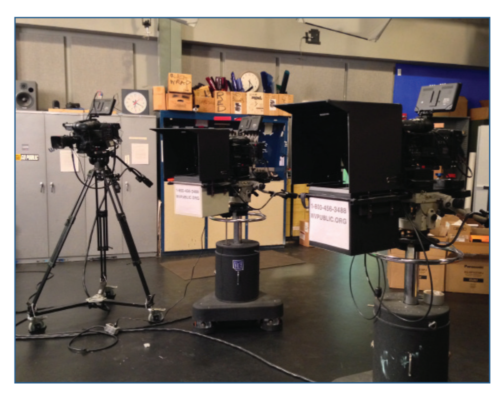
Upgrades shown above and below to Educational Broadcasting Authority's video production equipment included new cameras and a new control board.

"We started looking to finalize our equipment list in April of 2013; had the specs completed in August; the bid went out in September and it was awarded in November," recalled Blaker. "We received the equipment in Decem-