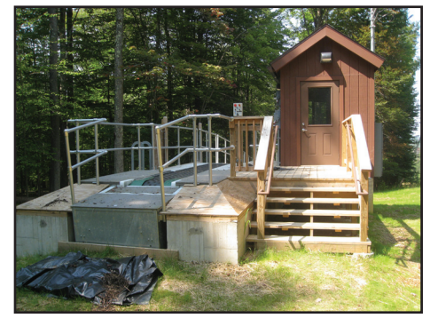
Pictured left, a modified pickup truck operated the towline that took sledders up the mountain at Blackwater Falls State Park. At right, the towline was replaced with an updated conveyor belt and operation building.