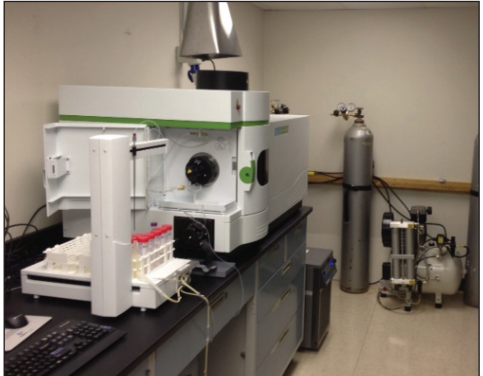
The Inductively Coupled Plasma Optical Emission Spectrophotometer purchased by the West Virginia Department of Agriculture provides an analysis of metals and nutrients in both water and land applied manure. It is the only such device of its kind owned by the state.

Agriculture's ICP is the newest piece of equipment in its laboratory, replacing an older machine with a similar function. "In order to maintain and keep the necessary laboratory accreditation, we need to keep up with technological advancements. In a laboratory setting, new pieces of equipment are constantly being developed. For us to