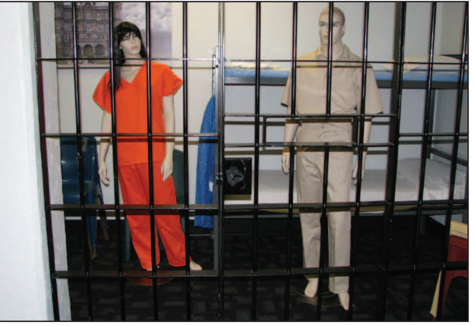
Mannequin models "Bonnie" and "Clyde" show off uniforms made by prisoners in the West Virginia Correctional Industries showroom in Charleston.