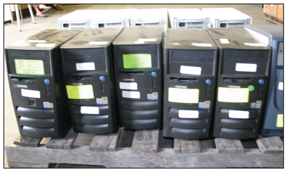
The purpose of statewide contract ERCYCL is to properly dispose of electronic equipment which has been retired and no longer has use. Retired electronics, such as computers, should be delivered to the Office of Technology warehouse in Kanawha City.

"Agencies are to follow proper sanitization procedures and are to still retire their electronic equipment to Surplus Property