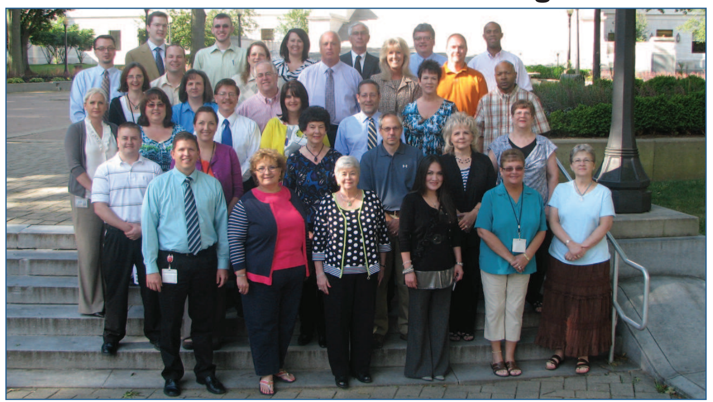
We are here to serve you!...The Purchasing Division continues its yearly tradition of taking an annual photograph of its staff each summer. The individuals pictured above represent a staff dedicated to serving its customers in a responsive and efficient manner. An updated staff photograph appears in the reception room as you enter the Purchasing Division.