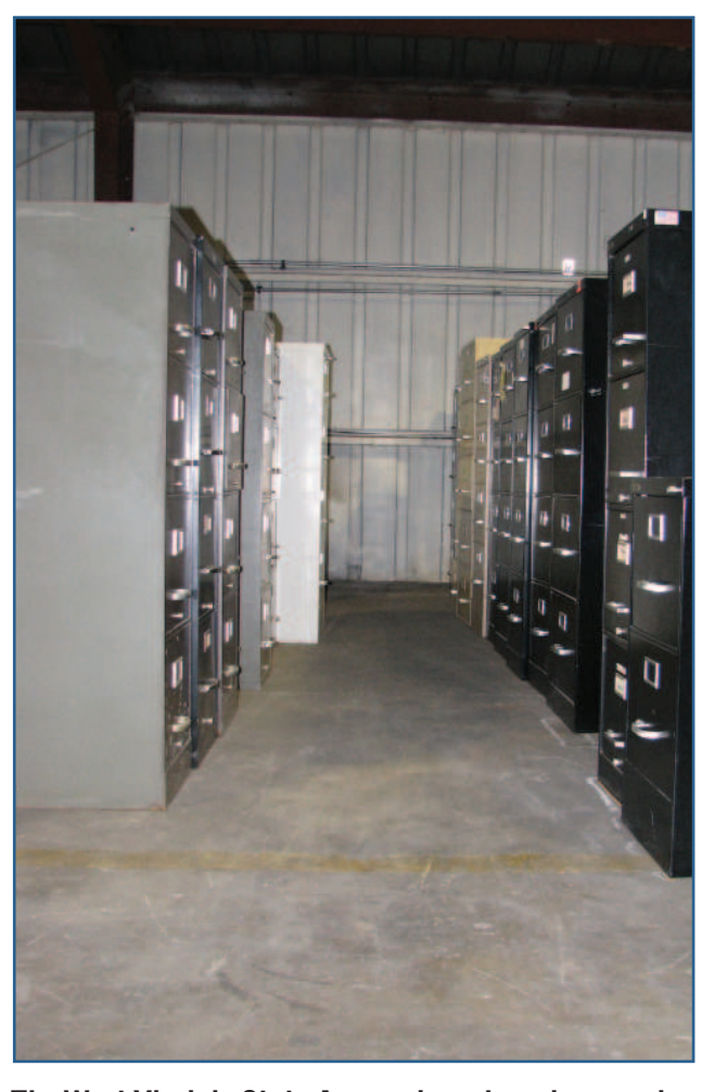
The West Virginia State Agency is undergoing a series of changes, including reorganizing the warehouse and general cleaning throughout the facility. Pictured are filing cabinets that are available to eligible organizations, such as state agencies.

The West Virginia State Agency for Surplus Property is a unit under the Program Services Section of the Purchasing Division. The WVSASP operates the State and Federal Surplus Property Programs, and has assisted thousands of eligible organizations by offering good, usable property at a substantially-reduced price. For more information about the West Virginia State Agency for Surplus Property please visit, <a href="http://www.state.wv.us/admin/purchase/surplus/default.html">http://www.state.wv.us/admin/purchase/surplus/default.html</a>.