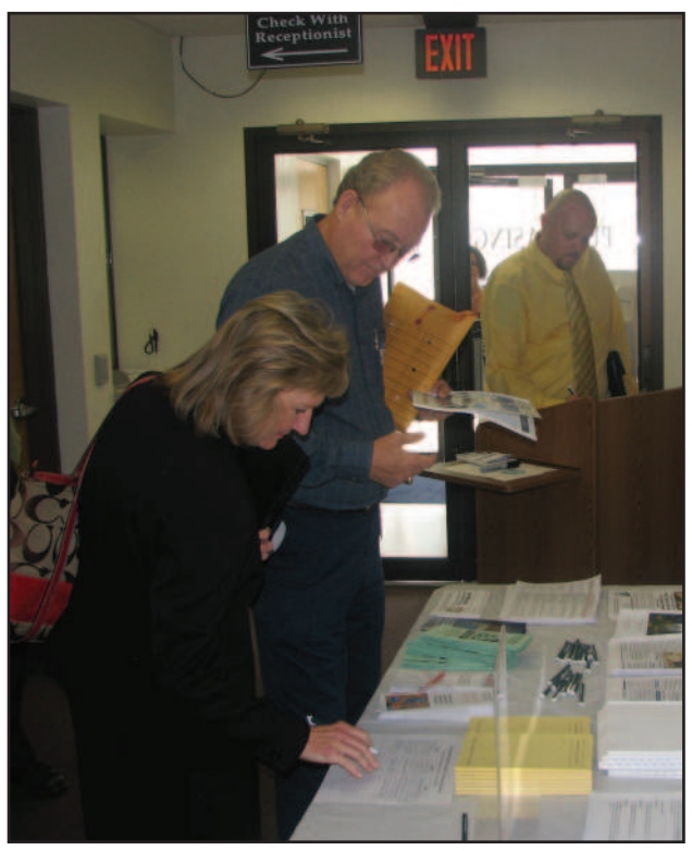
More than 70 procurement officers attended the fifth Annual Purchasing Division Open House.

THE BUYERS NETWORK is Published Monthly by the Purchasing Division of the West Virginia Department of Administration to Promote Better Value in Public Purchasing