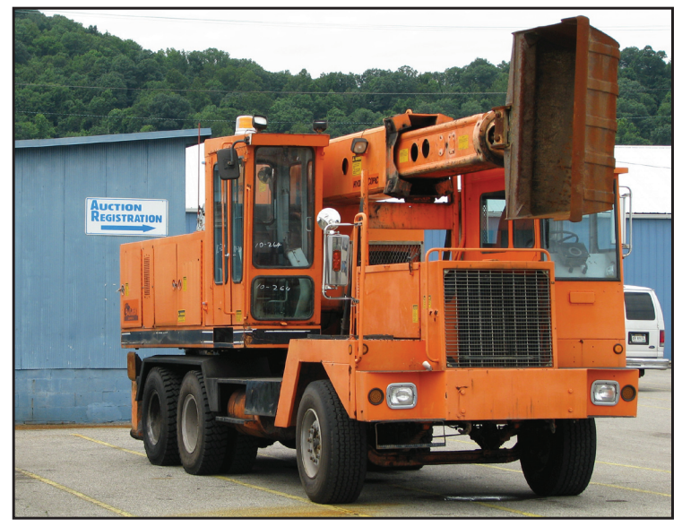
A hydroscopic excavator is just one of the numerous items the West Virginia State Agency for Surplus Property has sold through GovDeals.com.

In the future, WVSAP plans to assign a building con-