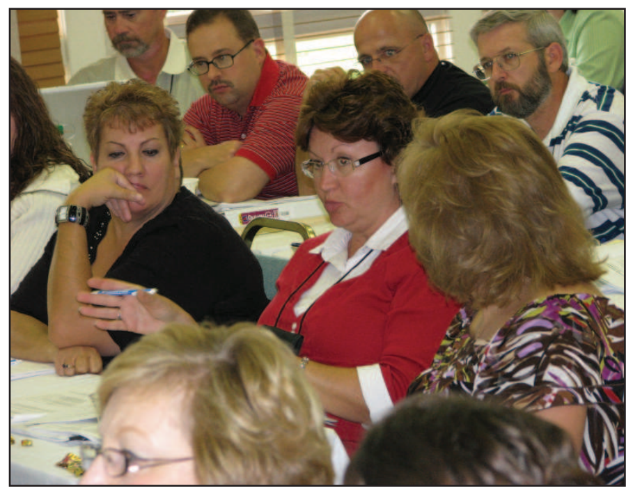
Participants of the 2010 Agency Purchasing Conference were encouraged to ask questions throughout this training event to learn more of the purchasing process.