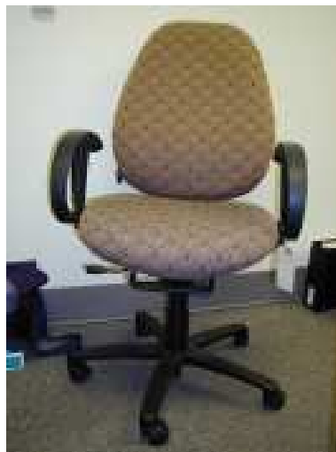
Pictured is just one of the many items that Correctional Industries offers to state agencies. This chair is available in different fabrics.

West Virginia Correctional Industries (CI) services the statewide contract for identification inventory tags (TAG03). These tags are the reflective,