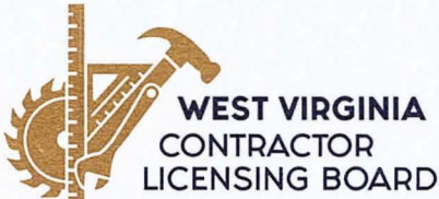
Chair, West Virginia Contractor Licensing Board

A copy of this license must be readily available for inspection by the Board on every job site where contracting work is being performed. This license number must appear in all advertisements, on all bid submissions, and on all fully executed and binding contracts. This license is non-transferable. This license is being issued under the provisions of West Virginia Code, Chapter 30, Article 42.