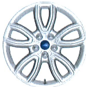
18" painted Aluminum wheels, Available in Police Upgrade Package (65U)