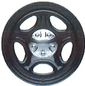
18" 5-spoke painted black steel wheels with center caps (5 th wheel is full-size spare) – Standard