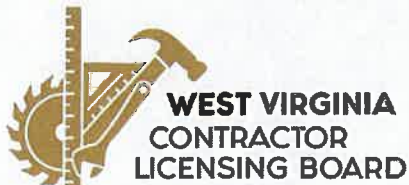
Chair, West Virginia Contractor Licensing Board

A copy of this license must be readily available for inspection by the Board on every job site where contracting work is being performed. This license number must appear in all advertisements, on all bid submissions, and on all fully executed and binding contracts. This license is non-transferable. This license is being issued under the provisions of West Virginia Code, Chapter 30, Article 42.