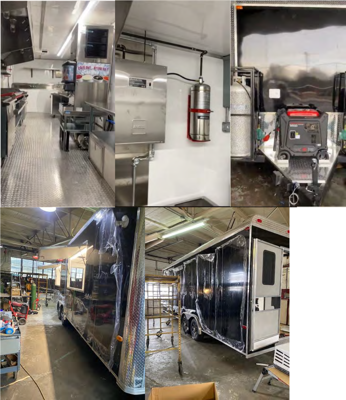
Custom Concession Trailer Phoenix Contracting built for Amarillo Texas Government.