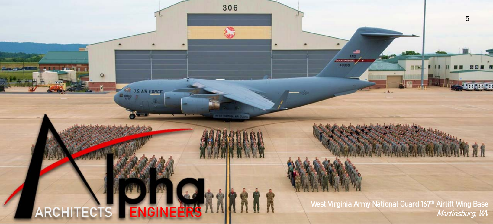
West Virginia Army National Guard 167 th Airlift Wing Base Martinsburg, WV

"Creating client-focused, innovation designs with quality and value that are sustainable and cost-effective"