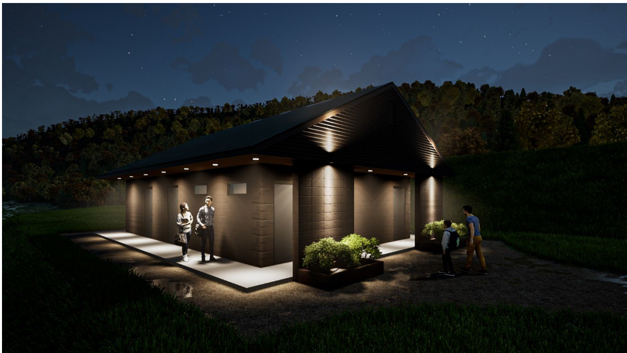
Thunder River Campground Bathhouse and Restrooms | Haysi, VA.