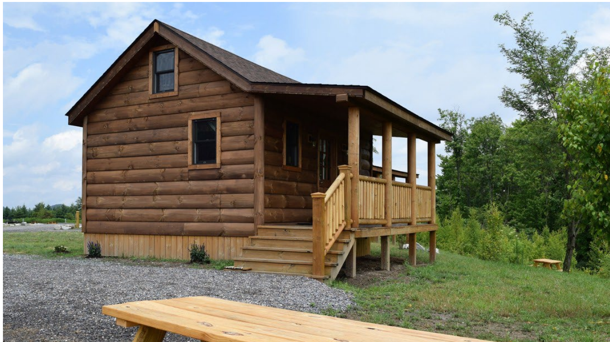
Southern Gap Outdoor Adventures Cabins | Southern Gap, Virginia