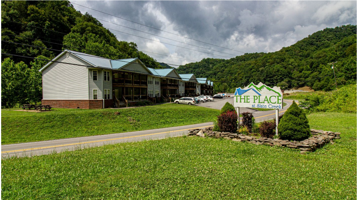
The Place at Slate Creek Apartment Complex | Grundy, Virginia