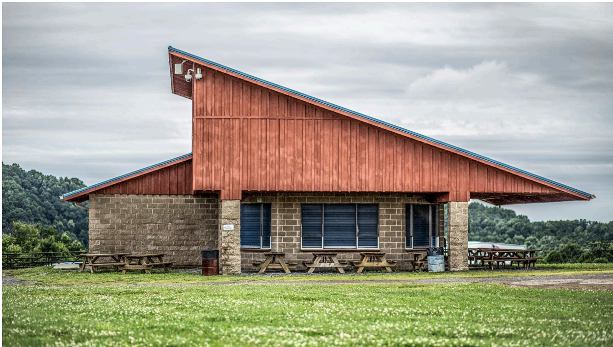
Poplar Gap Park Upper Level Concessions and Restroom Facility | Grundy, Virginia