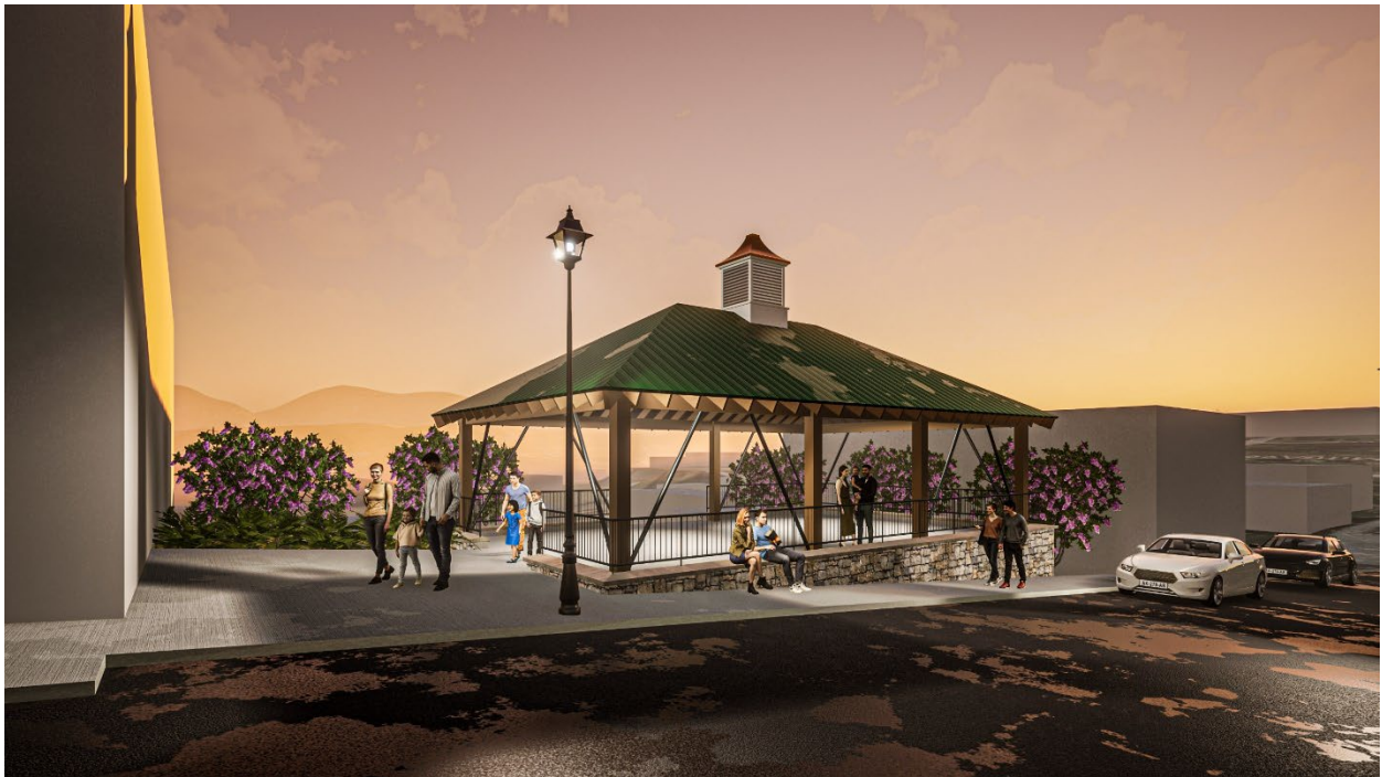
Historic Russell Theater Park Pavilion | Town of Lebanon, Virginia