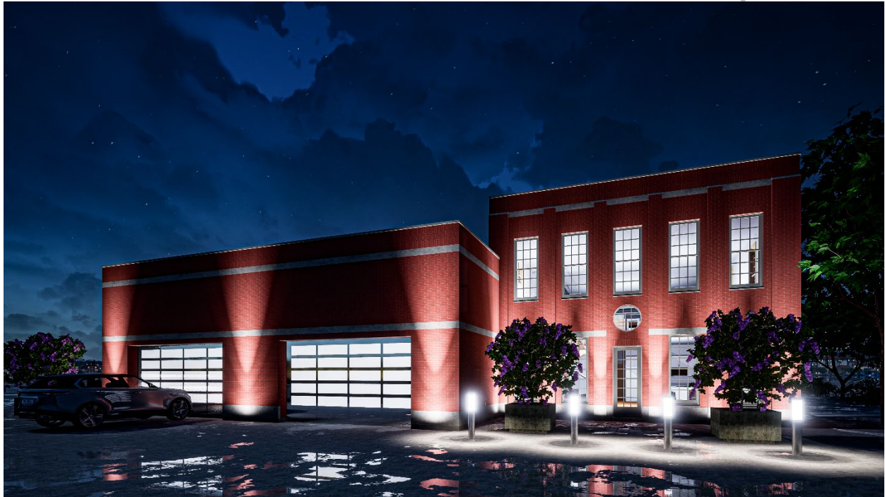
Kyte Mixed-Use Development | City of Bristol, Tennessee