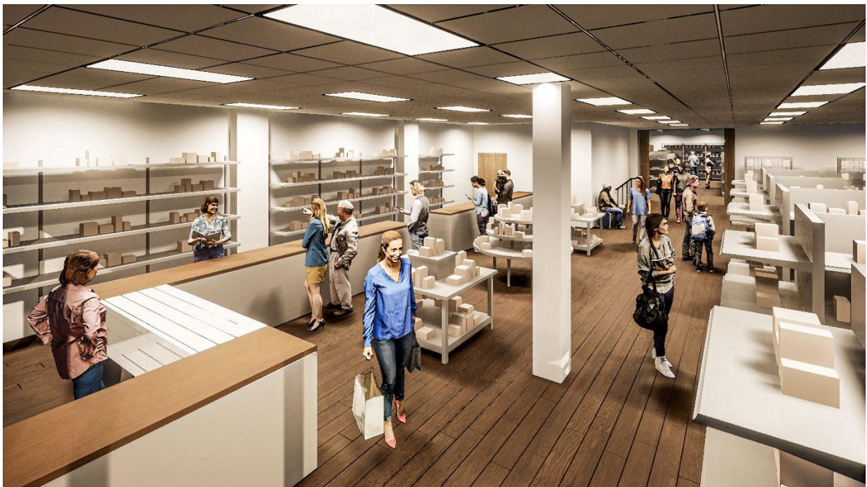
Sherry's Variety Store | Town of Grundy, Virginia