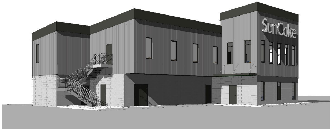
Jewell Coal and Coke Office Building & Bathhouse | Grundy, Virginia