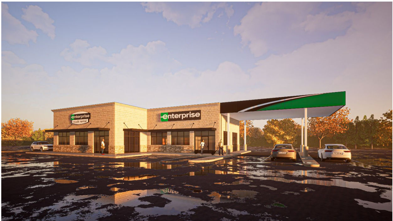
Enterprise Car and Truck Rental Facility | City of Parkersburg, West Virginia