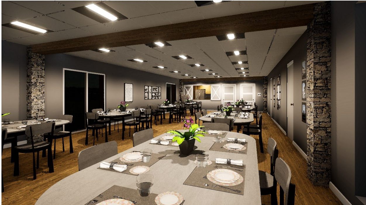
Samson Event Center | Grundy, Virginia