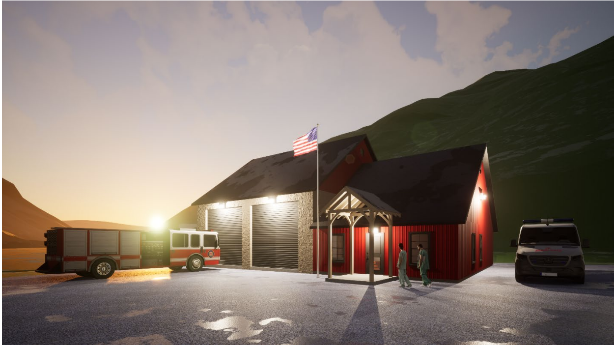
Knox Creek Fire Dept Fire Station | Hurley, Virginia