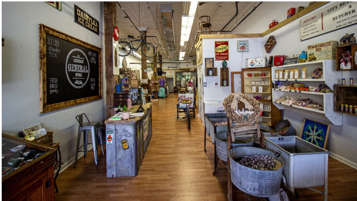
Abingdon General Store | Abingdon, Virginia