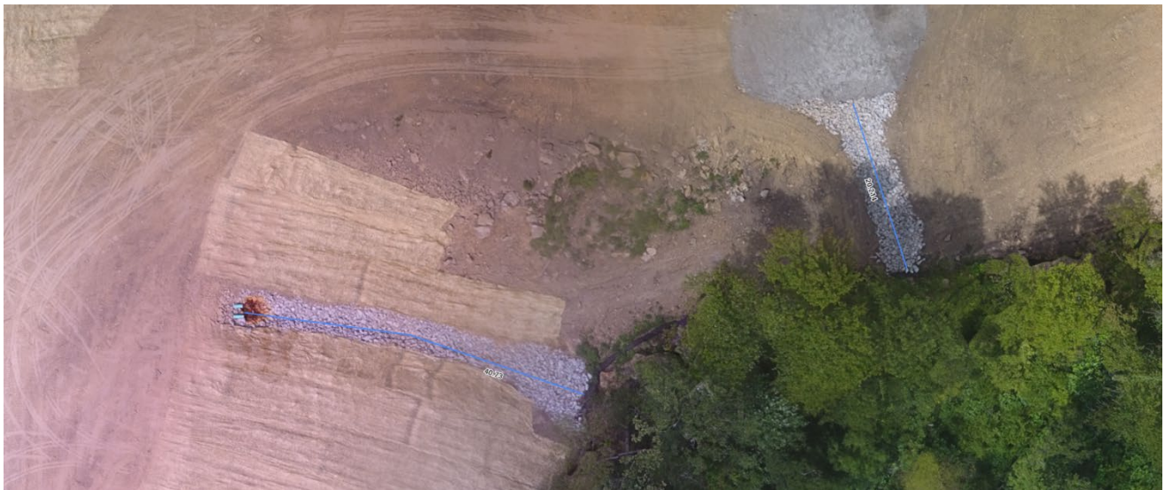
Canyon Run AML – As-Built Monitoring

Objective 2.4. Obtain/maintain/release all required permits.