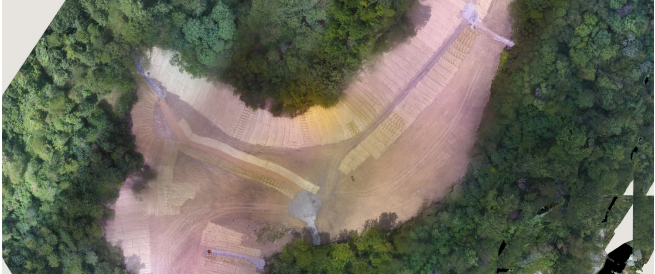
Canyon Run AML – As-Built Monitoring – 2020