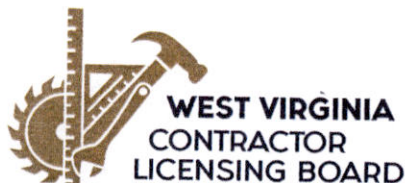
Chair, West Virginia Contractor Licensing Board

A copy of this license must be readily available for inspection by the Board on every job site where contracting work is being performed. This license number must appear in all advertisements, on all bid submissions, and on all fully executed and binding contracts. This license is non-transferable. This license is being issued under the provisions of West Virginia Code, Chapter 30, Article 42.