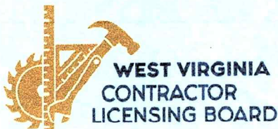
Chair, West Virginia Contractor Licensing Board

A copy of this license must be readily available for inspection by the Board on every job site where contracting work is being performed. This license number must appear in all advertisements, on all bid submissions, and on all fully executed and binding contracts. This license is non-transferable. This license is being issued under the provisions of West Virginia Code, Chapter 30, Article 42.