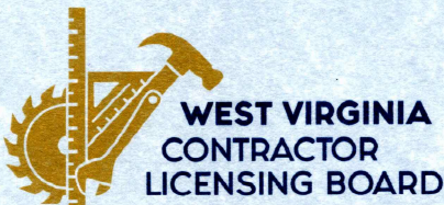
Chair, West Virginia Contractor Licensing Board

A copy of this license must be readily available for inspection by the Board on every job site where contracting work is being performed. This license number must appear in all advertisements, on all bid submissions, and on all fully executed and binding contracts. This license is non-transferable. This license is being issued under the provisions of West Virginia Code, Chapter 30, Article 42.