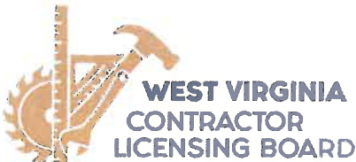
Chair, West Virginia Contractor Licensing Board

A copy of this license must be readily available for inspection by the Board on every job site where contracting work is being performed. This license number must appear in all advertisements, on all bid submissions, and on all fully executed and binding contracts. This license is non-transferable. This license is being issued under the provisions of West Virginia Code, Chapter 30, Article 42.