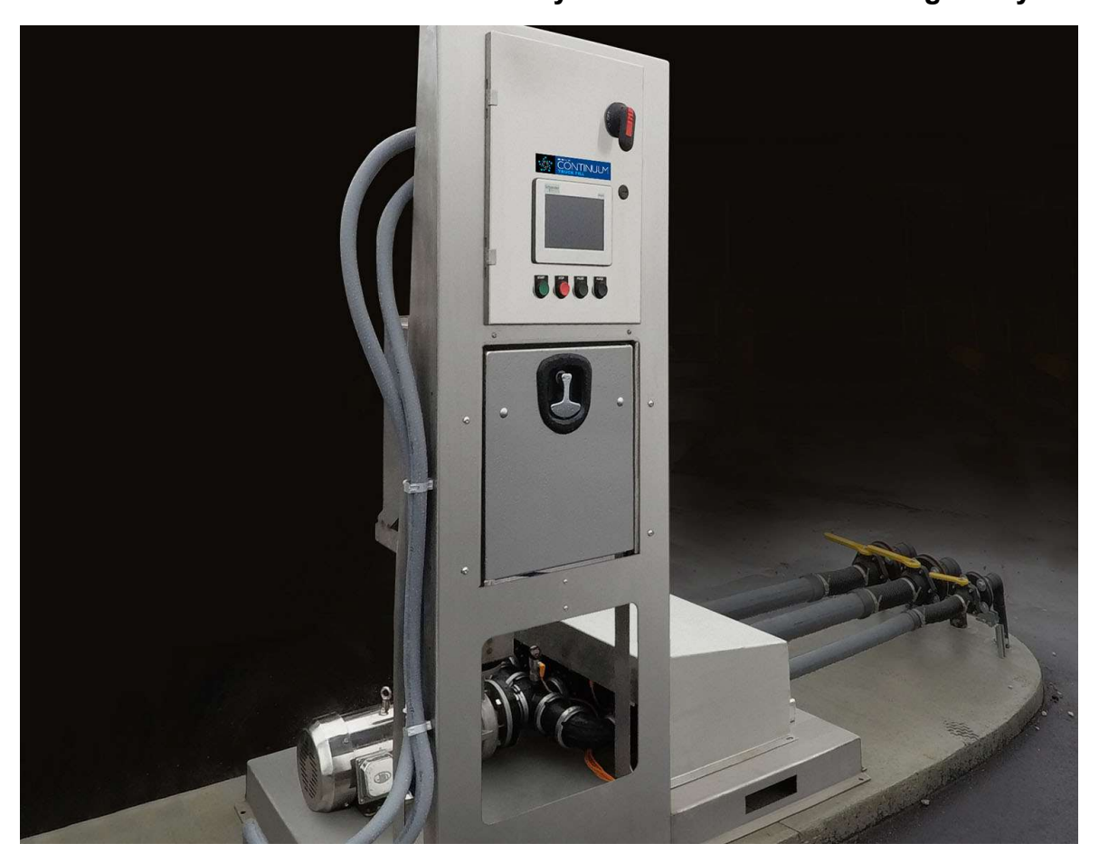
TF-XR Shown above with 5HP SS Motor, and optional Toolbox & Air Puge