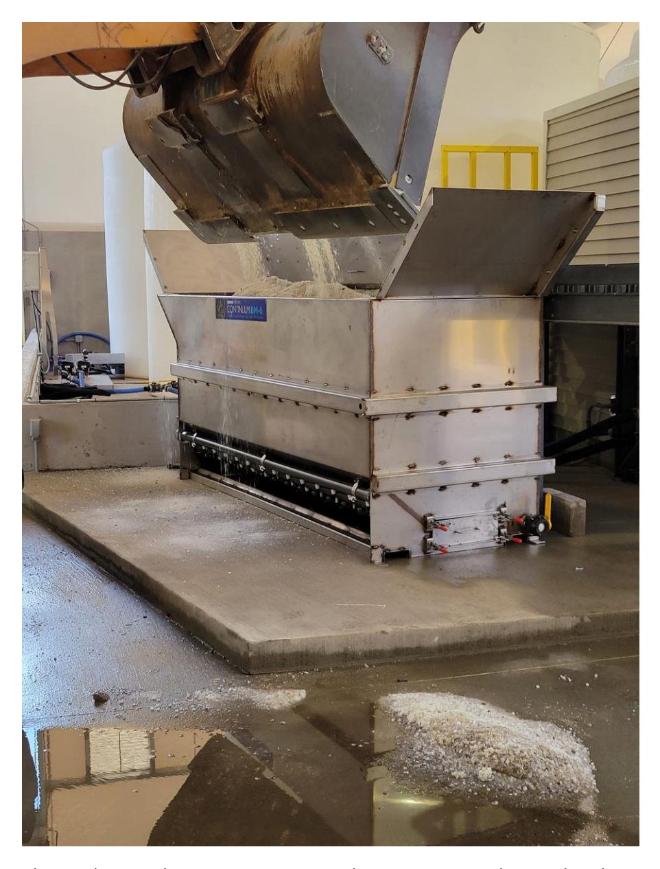
Shown above with Hopper Extension and Remote Mounted Controls Below