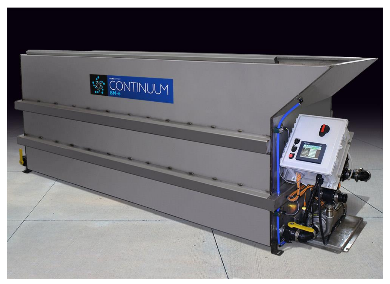
BM-6 Shown above with integral controls, without hopper extension