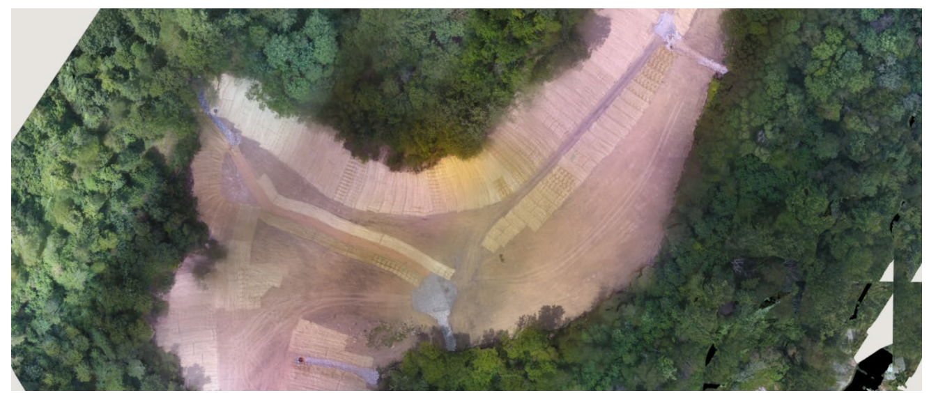
Canyon Run AML - As-Built Monitoring - 2020