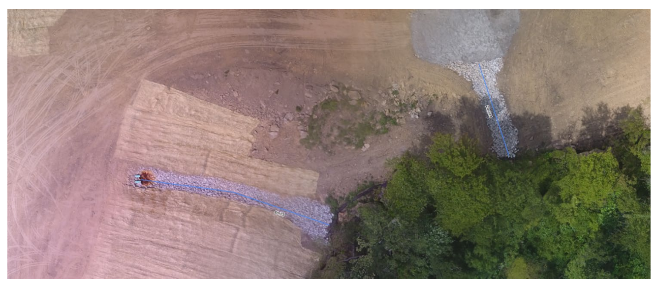
Canyon Run AML - As-Built Monitoring

Objective 2.4. Obtain/maintain/release all required permits.