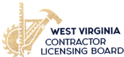
Chair, West Virginia Contractor Licensing Board

A copy of this license must be readily available for inspection by the Board on every job site where contracting work is being performed. This license number must appear in all advertisements, on all bid submissions, and on all fully executed and binding contracts. This license is non-transferable. This license is being issued under the provisions of West Virginia Code, Chapter 30, Article 42.