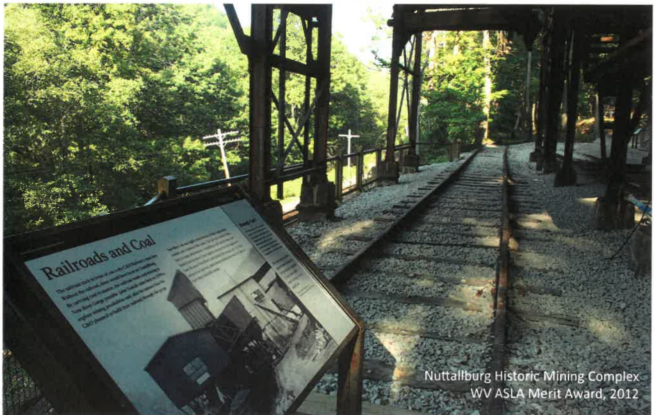
Nuttallburg Historic Mining Complex WV ASLA Merit Award, 2012