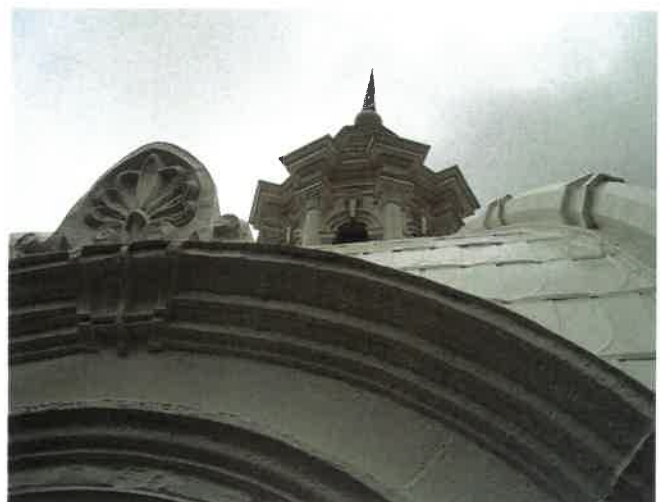
Dome Restoration Detail

Since the design and construction of the courthouse annex in 1995, Chapman Technical Group has been involved in several improvement and restoration projects at the Courthouse in Buckhannon. In 2005, a lift was installed and plaza renovated in make the original Courthouse accessible. In 2006, the Courthouse dome and clock tower were completely restored. In 2007, the Courthouse portico stonework was restored, and in 2008 the work was honored by the AIA, WV for Excellence in Architecture.