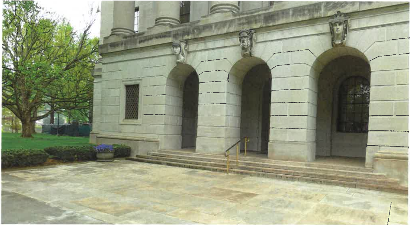
West Virginia Department of Administration WV State Capitol East Plaza, Governor's Entry, and East Executive Stairs Charleston, West Virginia

Deterioration of limestone pavers and granite stairs caused trip hazards at various locations around the historic WV State Capitol, circa 1933. Chapman Technical Group designed and provided construction administration for their restoration and repair. Deteriorated limestone pavers were replaced, and all pavers were re-set over a concrete slab to reinforce them against occasional vehicular traffic. The granite stair slabs were reset over concrete to eliminate differential settlement that had become problematic. Handrails were replaced with bronze rails.