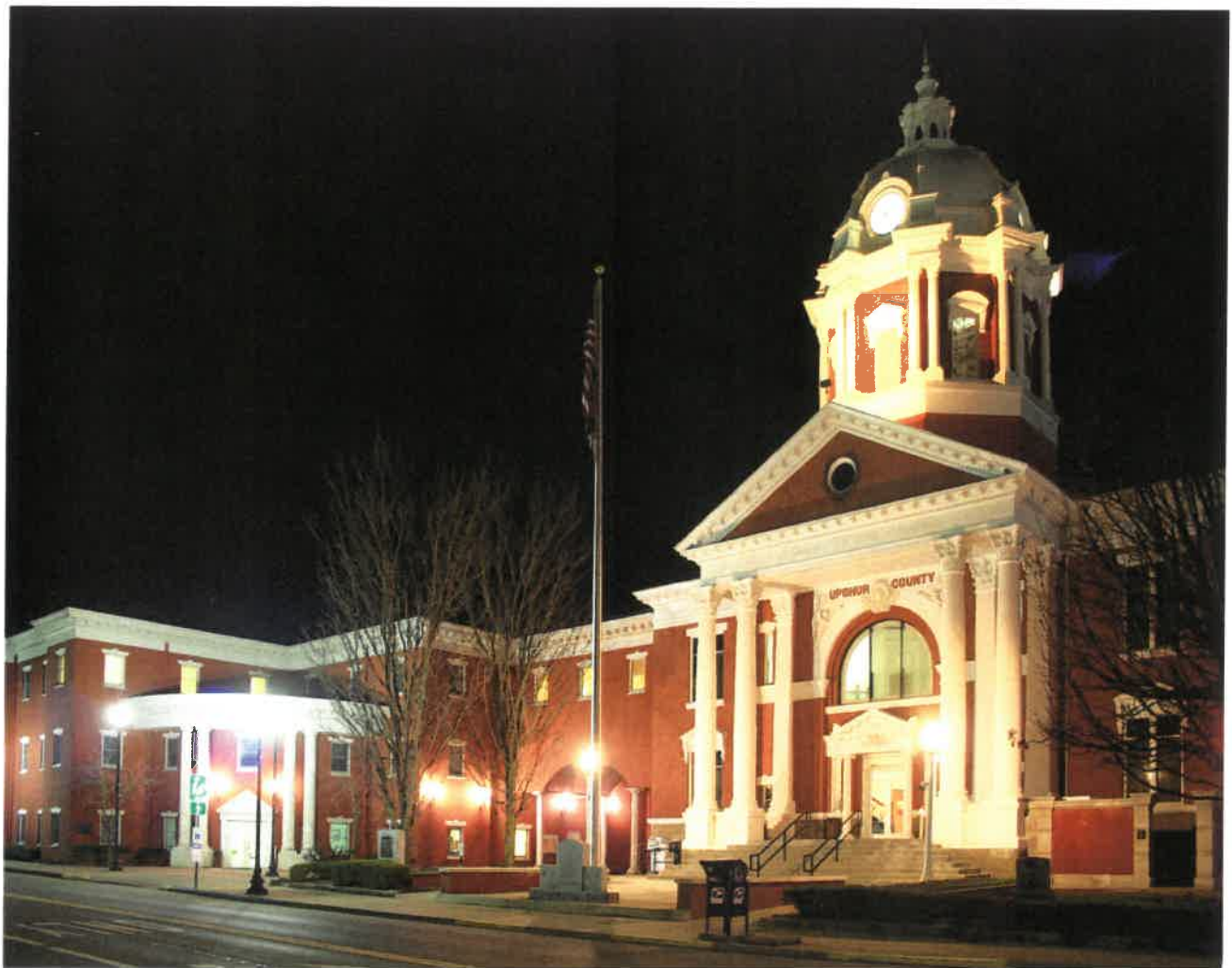
American Institute of Architects, Honor Award, 2008