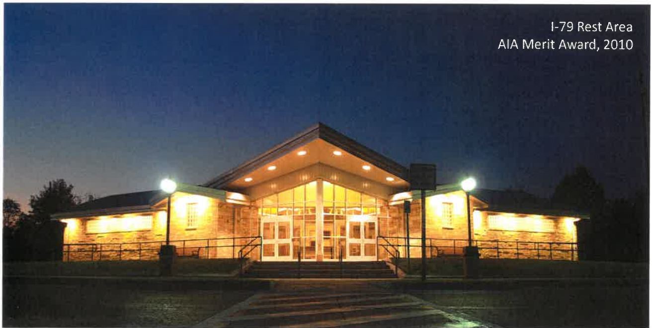
I-79 Rest Area AIA Merit Award, 2010