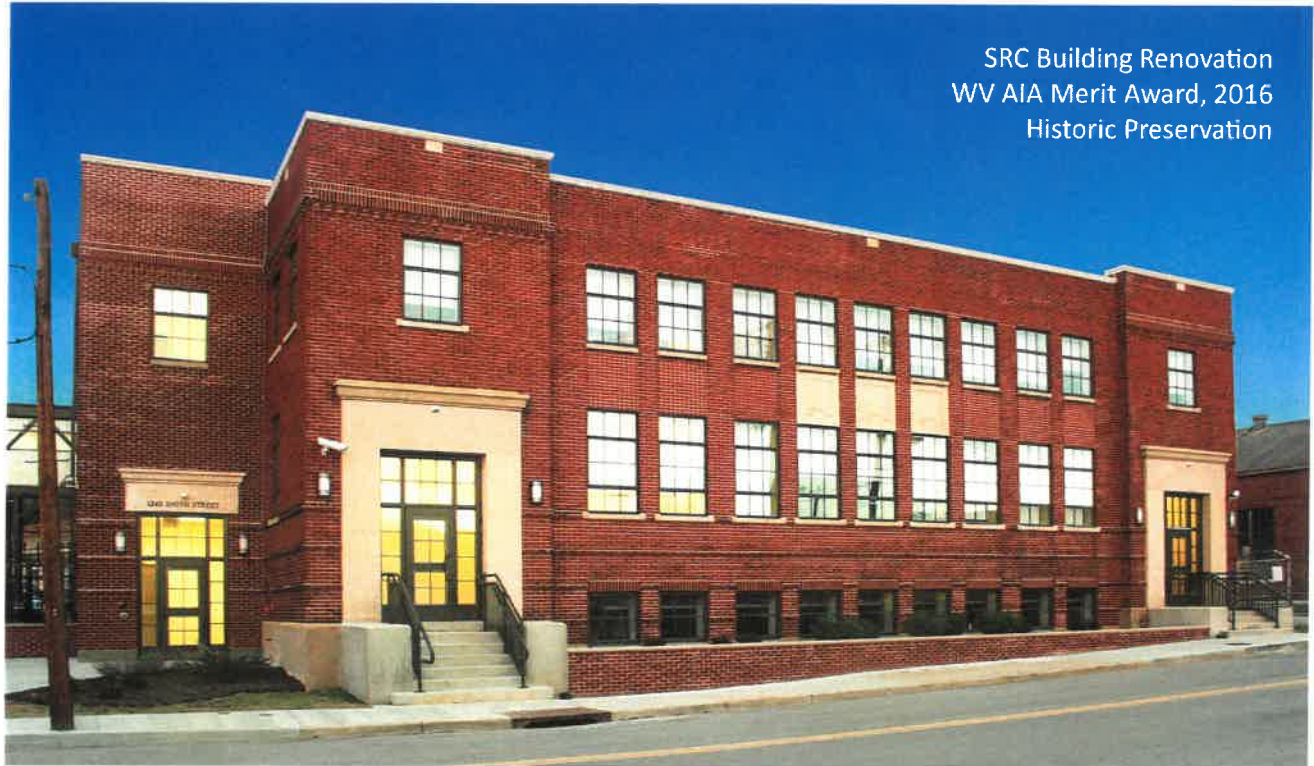
SRC Building Renovation WV AIA Merit Award, 2016 Historic Preservation