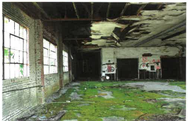
Right: Interior prior to renovation.