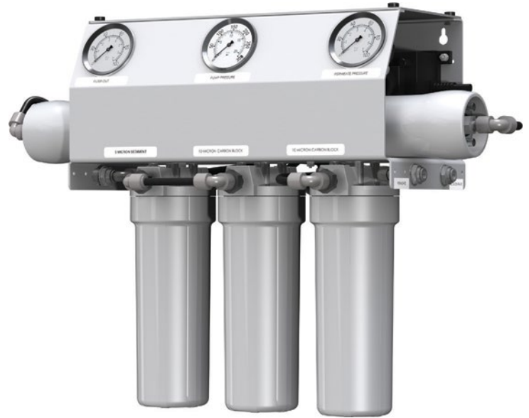
L1-505 Wall Mount Reverse Osmosis System

feature a compact wall mount space saving design and comes pre-assembled and ready for immediate service with simple utility connections. These systems are available in capacities of 405 to 480 gallons per day and feature a single pump design for reliable performance. Each model is engineered with quality AXEON components including a 15 gallon storage tank, fiberglass (FRP) membrane housings, extra low energy membranes, pressure gauges, filters and housings.