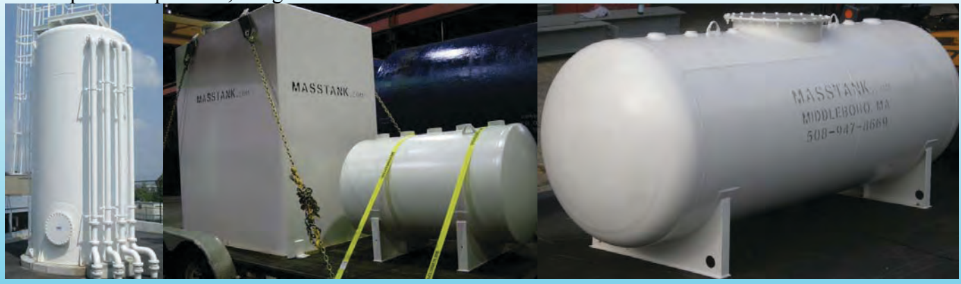
Double Wall Above Ground Tanks – Provide 300° or 360° containment without the need for vaults or earthen dikes.