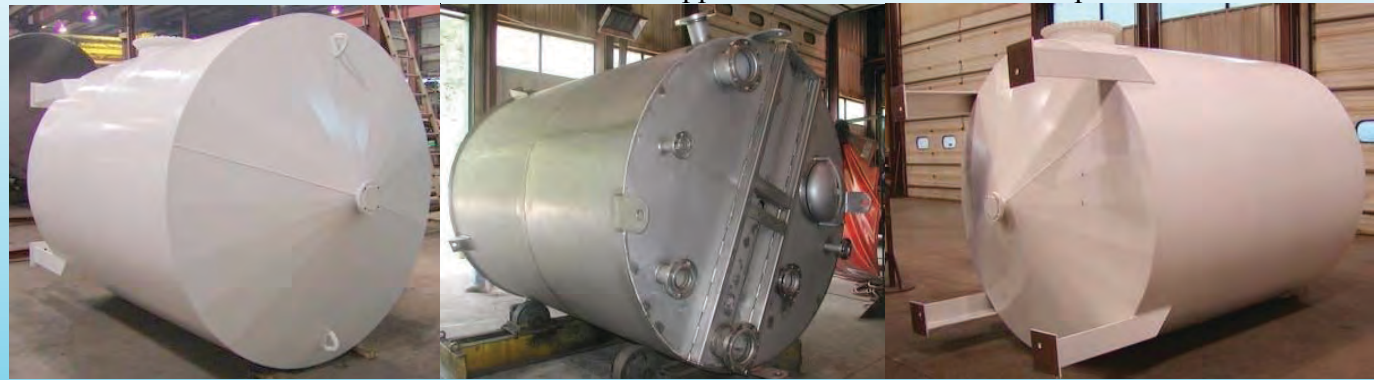
New York City Approved Tanks – Cylindrical, rectangular and field erected tanks to conform with the NYC standards.

Vertical Tanks – Standard and custom sizes for all applications with flat or cone tops and bottoms.