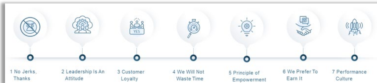
Figure 1. VSO First Principles

VSO has built a valuable company by building a company of values. The image below shows VSO's 7 First Principles which the company uses to measure all our work. More information on our First Principles can be found on our website at www.vso-inc.com/about .