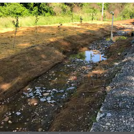
Impacted Stream Post Construction