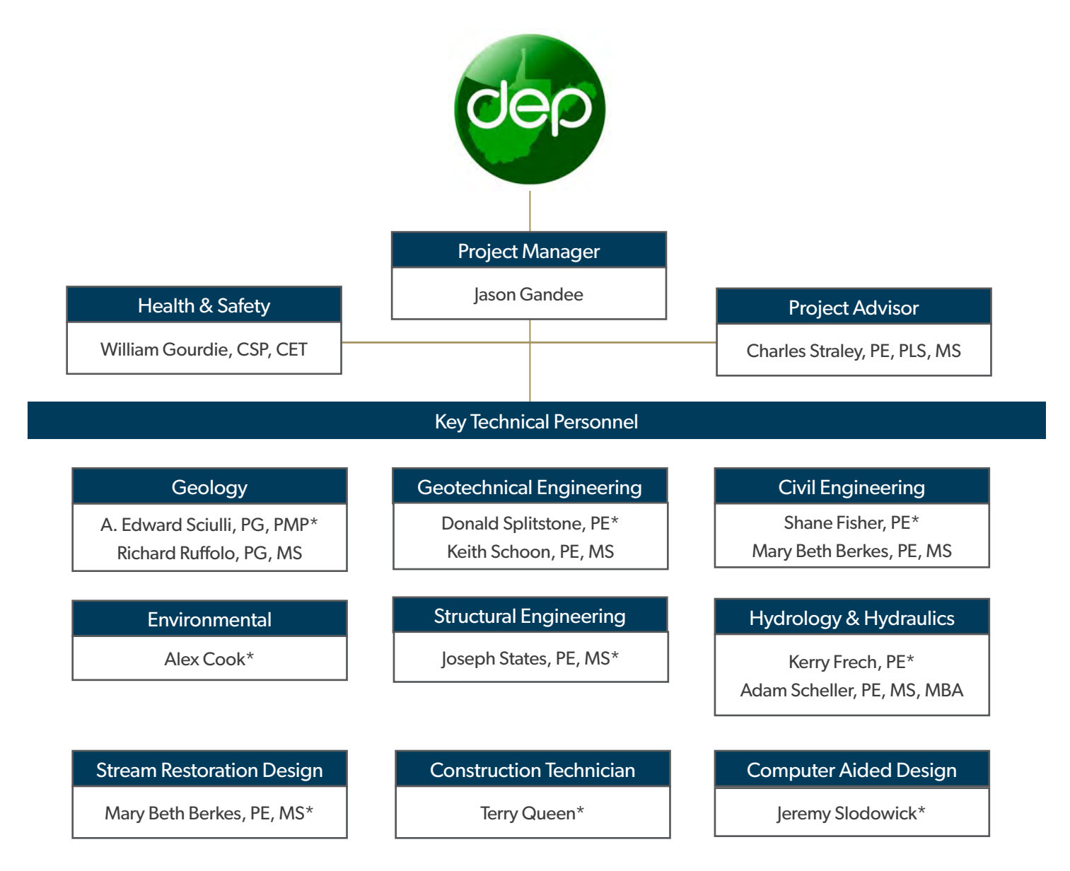
FIGURE 1 - PROJECT ORGANIZATIONAL CHART

<u>Notes</u> *GAI designated discipline lead