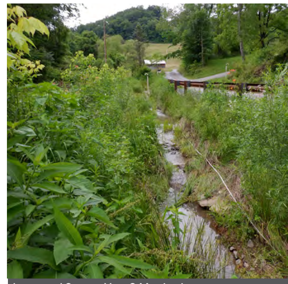
Impacted Stream Year 2 Monitoring