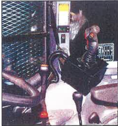
OPTIONAL JOY STICK