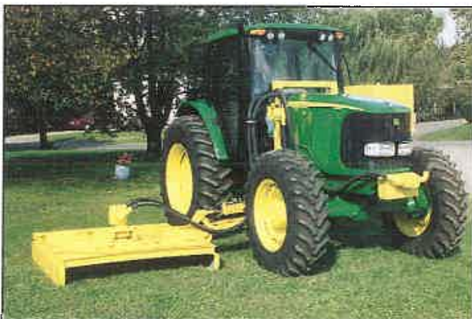
SIDE ROTARY WITH & WITHOUT BREAKAWAY