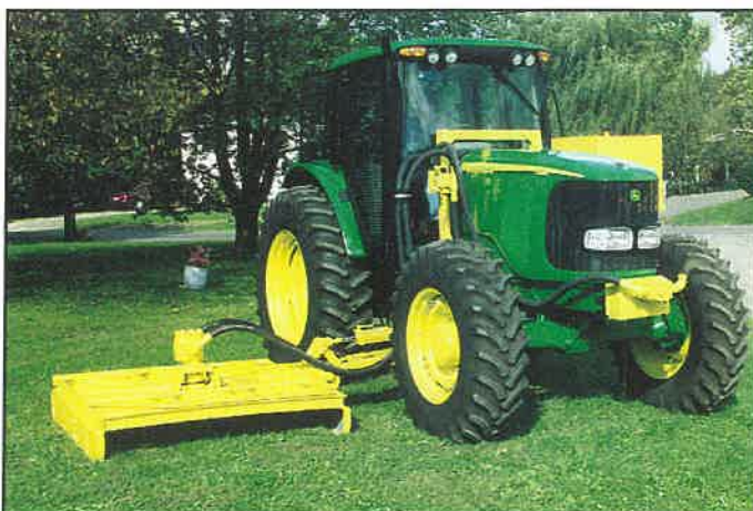
SIDE ROTARY WITH & WITHOUT BREAKAWAY