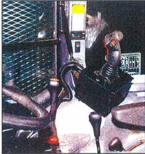
OPTIONAL JOY STICK