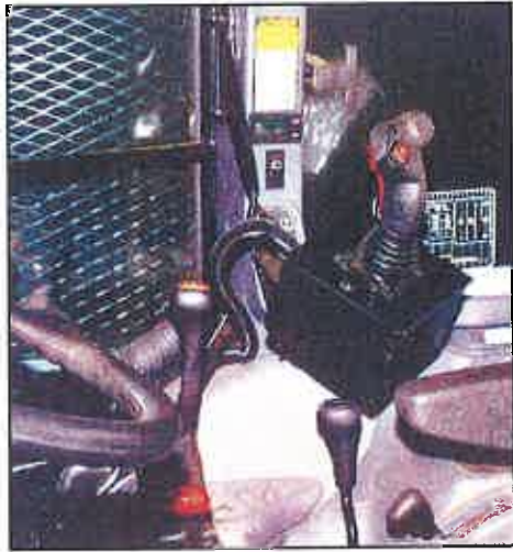
OPTIONAL JOY STICK