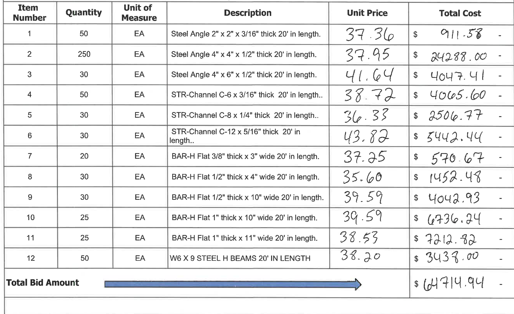
Exhibit A Pricing Page CRFQ DOT2000000040