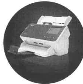
Alaris S2060w/S2080w Scanners