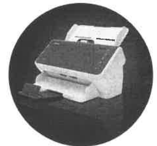
Alaris S2040/S2050/S2070 Scanners