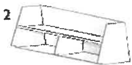
Exhibit B: Truck Shelving Diagram