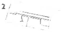
Exhibit B: Truck Shelving Diagram